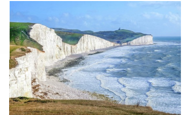
The Seven Sisters chalk cliffs in East Sussex.