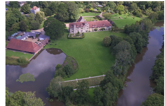
An oblique aerial photograph showing the area around Michelham Priory today.