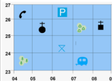
A map that uses 4 figure grid references