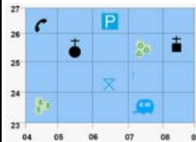
A map that uses 4 figure grid references

There are a range of topographical features in the area. These include the River Wey, as well as man made (human) features such as roads and buildings.