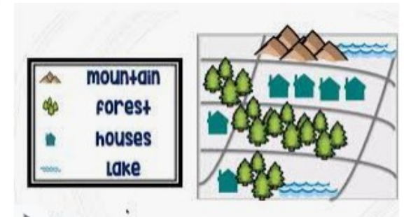
A map key with symbols