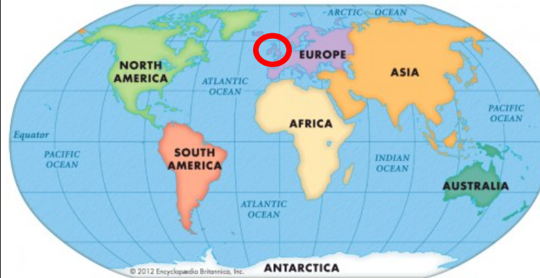
The Battlefield at Senlac Hill

We will learn to use a compass and read the directions on it .